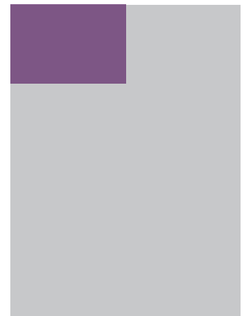
Eighth Page $75 3.56 x 2.37 in