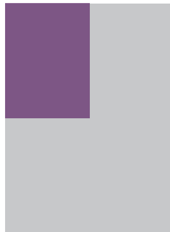
Quarter Page $150 3.75 x 5 in